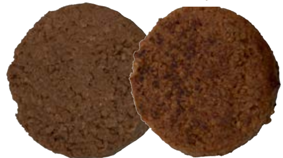
Coloured with FiorioClean Beef Patty (uncooked vs cooked) | Rich, almost juicy-looking, deep red-brown tones