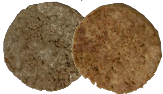
Uncoloured (uncooked vs cooked) | Pale, ashy grey hue, yellow tones when cooked.

FiorioColori has developed a heat stable 'Beef Patty' colouring to replicate the satisfying caramelised appearance of its meat counterpart. Developed initially for pea protein burgers but also successful in soy based products.