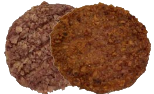
FiorioClean Future Blend 2.5% (uncooked vs cooked)