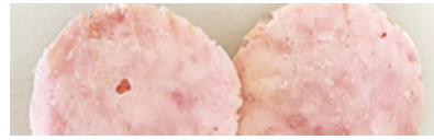
Coloured 0.2% | Authentic, pink hues