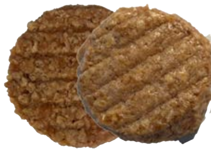
FiorioClean Future Blend Plus 1.3% (uncooked vs cooked)