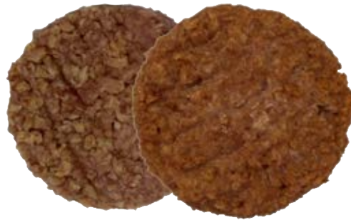
FiorioClean Future Blend 1.3% (uncooked vs cooked)