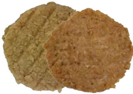
Uncoloured (uncooked vs cooked)

Transforming a vegan burger from a pale yellow to a deep brown, using FiorioClean Future Blend.