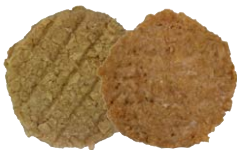
Uncoloured (uncooked vs cooked)

Transforming a vegan burger from a pale yellow to a strong burnt orange-brown, giving the appearance of an intense meat profile, coloured using FiorioClean Future Blend Plus.