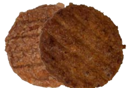
FiorioClean Future Blend Plus 2.5% (uncooked vs cooked)