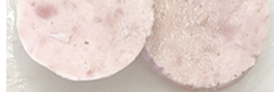
Uncoloured | White-grey, slight tint

Highly stable when tested on a reconstituted salted pork in brine and steamed.